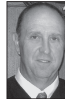
Hon. Michael J. Gerou 35th District Court Plymouth (Plymouth only)