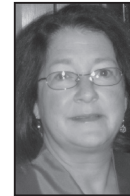
Hon. Jeanine Nemesi LaVille 61st District Court Grand Rapids (Grand Rapids only)